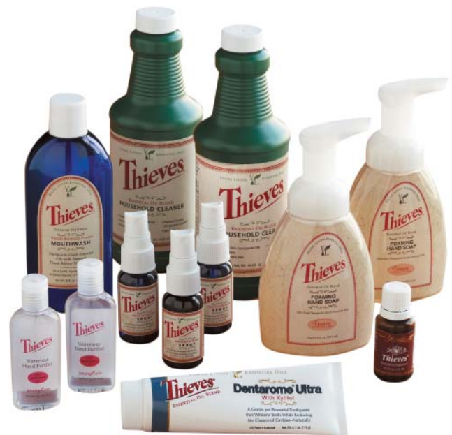
Thieves Essential Rewards Pack (one extra Thieves Spray is pictured than is in the pack)

When you're away from home or traveling, Thieves Spray is indispensable for protecting you from undesirable microorganisms. Spray it on surfaces—door handles, toilet seats—any spot that needs cleansing. Small bottle fits anywhere, lasts a long time.